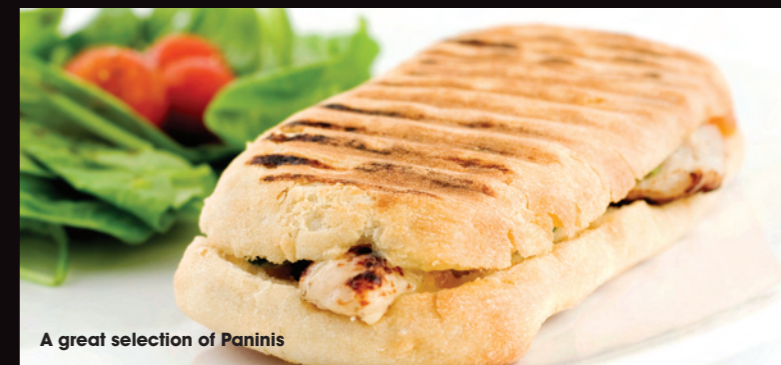
A great selection of Paninis