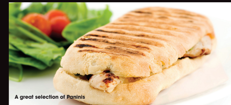
A great selection of Paninis